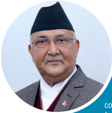
RIGHT HONORABLE PRIME MINISTER MR. K P SHARMA OLI

Nepal is a unique investment destination, given its diverse resources, huge market access across the borders and government's single-most priority on development. With accomplishment of political stability, strong commitment to good governance and improving infrastructure, Nepal is looking forward to rapid investment growth in several potential areas of industry and infrastructure. As the focus of the current government is on economic prosperity, very much aligned with the vision of " Prosperous Nepal: Happy Nepali ", I consider Nepal Investment Summit 2019 as a distinctive opportunity to realize the potentials of the country as well as of the investors.