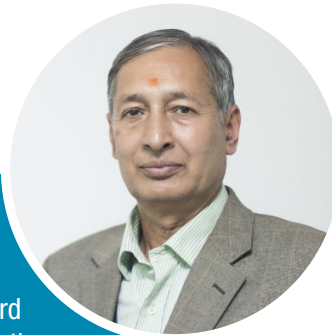
HONORABLE MINISTER FOR FINANCE AND, CONVENOR, NEPAL INVESTMENT SUMMIT 2019 DR. YUBA RAJ KHATIWADA

The role of investment, be it domestic or foreign, is crucial to achieve high economic growth and realize Nepal's aim of becoming a middle-income country by 2030. As part of our endeavor toward establishing Nepal as a promising investment destination, Nepal Investment Summit 2019 is an opportunity for us to exhibit the range of policy, structural and procedural reforms undertaken by the government to create a conducive environment for investing and doing business in Nepal.